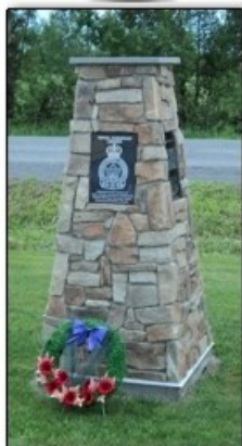
Branch 625 Richmond