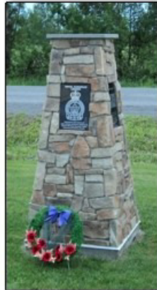
Branch 625 Richmond