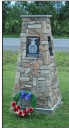
Branch 625 Richmond